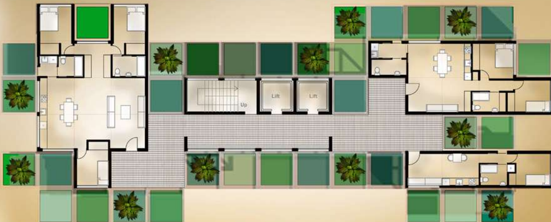
Random Storey Plan to show different Types of Units (It can be different at each level)